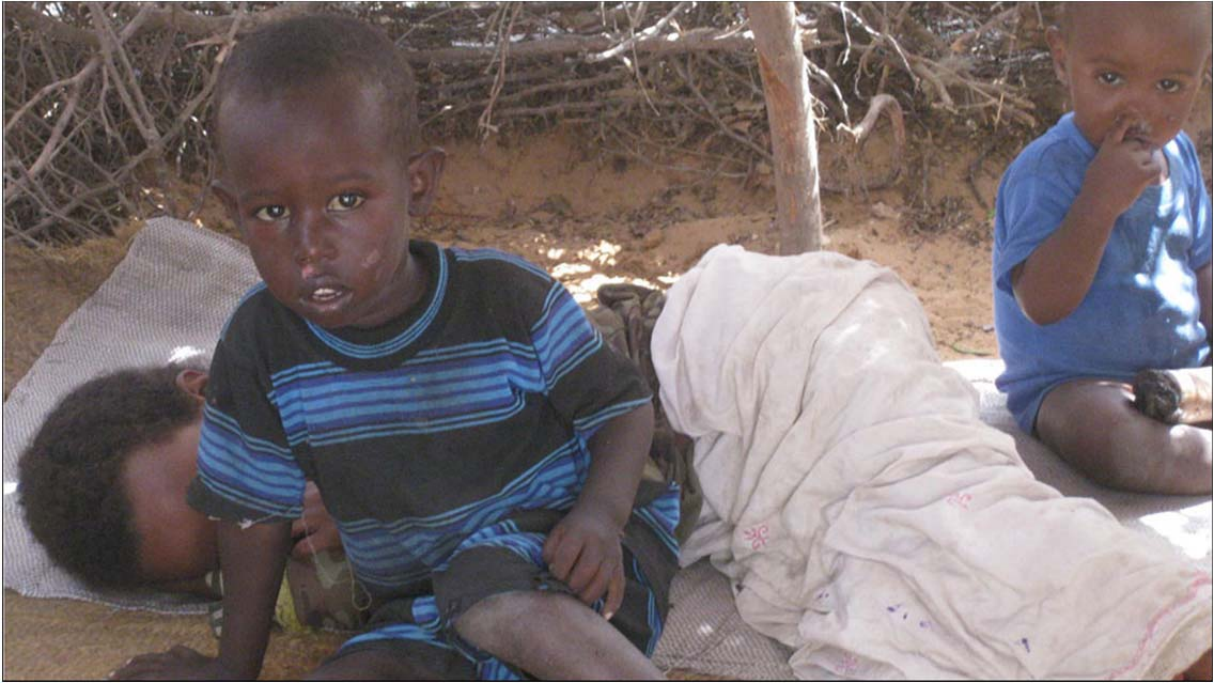
From Horror to Hopelessness: Kenya's Forgotten Somali Refugee Crisis